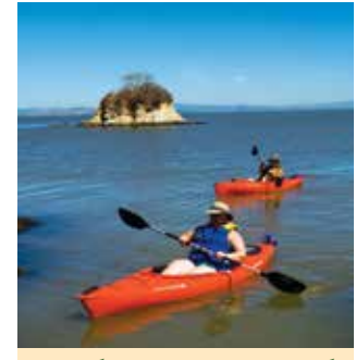
Kayaking near Rat Rock

Picnic sites with tables and barbecues are located at scenic China Camp Point, Bullhead Flat, Miwok Meadows, Weber Point, and Buckeye Point.